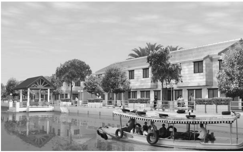
PHOTO 5 Housing design in Samakkee-ruamjai community

materials through narrow streets, as well as a limited area for construction and the need for temporary housing during construction.