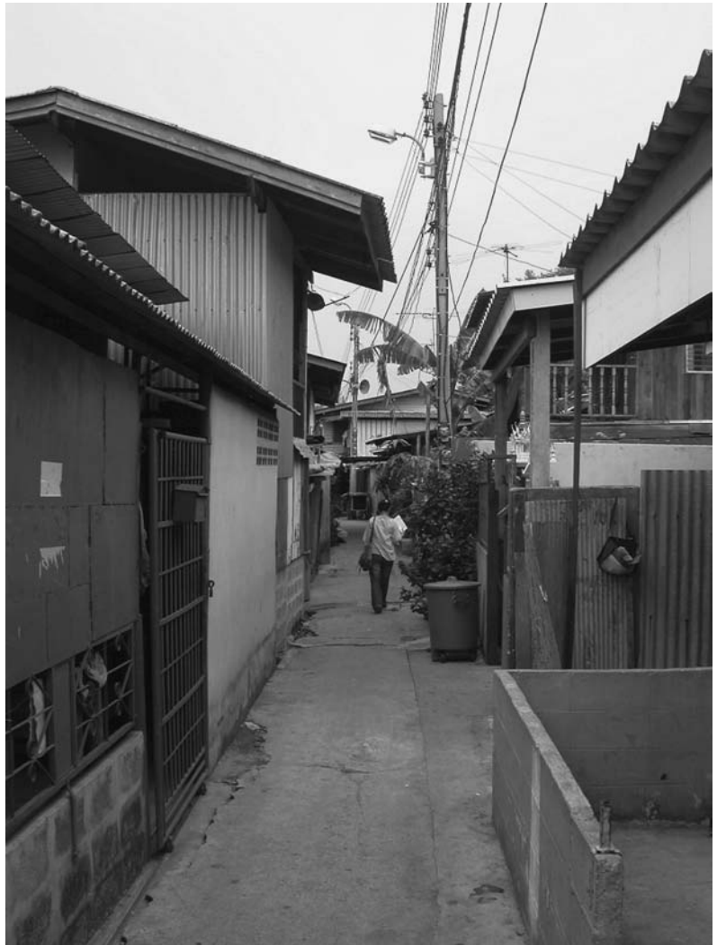
PHOTO 2 Physical characteristics of Ruamjaipattana-South community

land plot with secure tenure and the possibility of either renting it or buying it through the community's housing savings group. If people wanted to stay in their current locations and upgrade or reconstruct their homes, they needed to negotiate for the right to do so and needed to reach agreement on the rental or purchase of land sites from the land-owners. After several public hearings in open community panels, the Bangbua residents reached agreement that they would like to continue living in the area with a rearranging and upgrading of the housing and infrastructure.