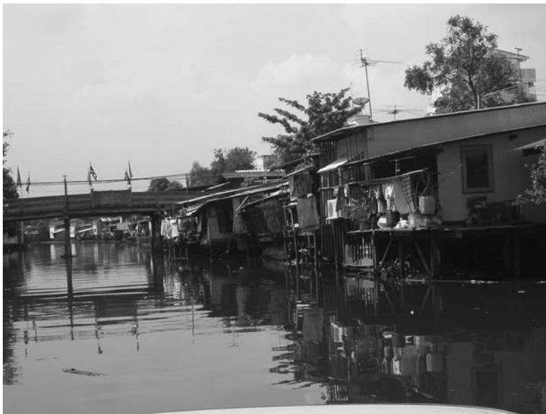
PHOTO 1 An example of informal canal settlements

government's current urban poor housing policy suggests an alternative approach, namely upgrading through its Community Organization Development Institute (CODI). CODI has been successful in developing cooperation between illegal settlers and those government authorities whose land they have occupied, and for these nine canal settlements, an agreement to allow the upgrading was reached between CODI and the Treasury Department, which owns this land.