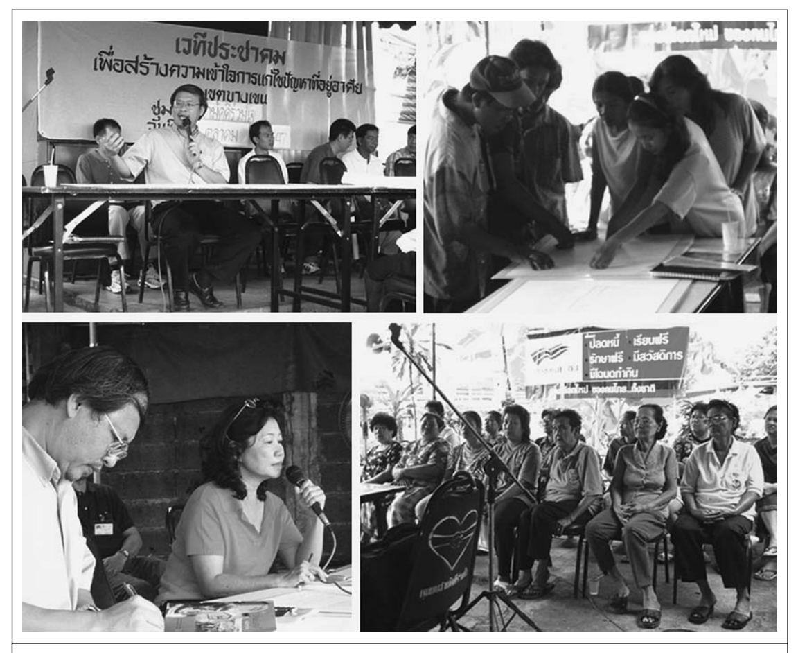
PHOTO 3 Open panels and public hearings in communities with related stakeholders

After a general consensus has been reached with regard to redevelopment, the WGHBC then works with smaller groups. It thus began with