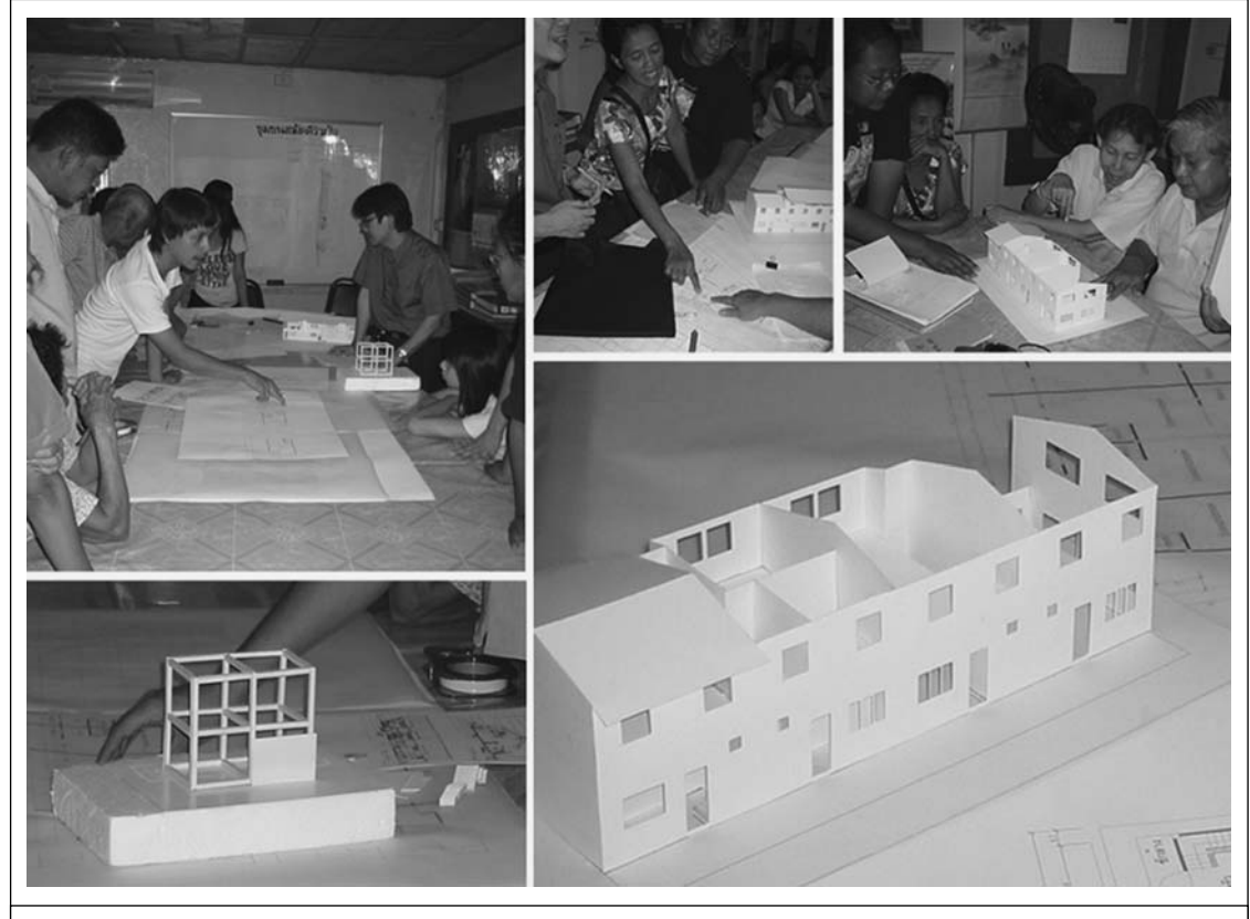
PHOTO 4 Design process with community participation; small groups working