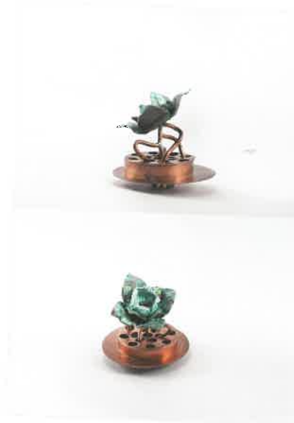
Growth of Chemicals 50x6.5

Profile • Graduated M.F.A jewelry design from Sinlapakorn university, Thailand. • Served as a lecturer of Jewelry Design Department at Burapha University Chanthaburi campus and Researchers focus on developing jewelry design.