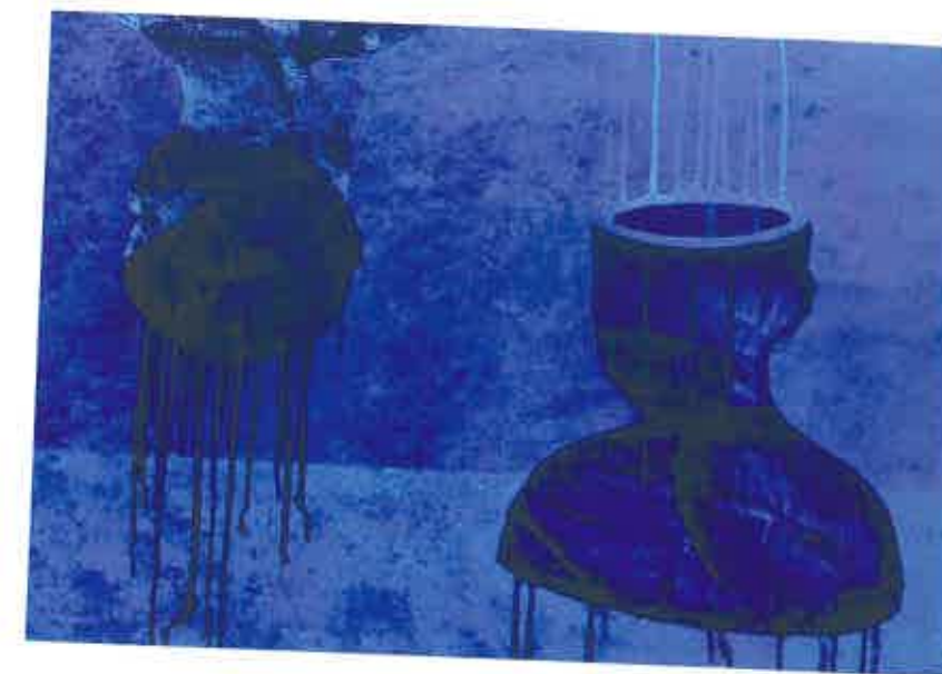
In blue 50x70

Profile • Digital Arts Instructor of School of Digital Media Sripatum University